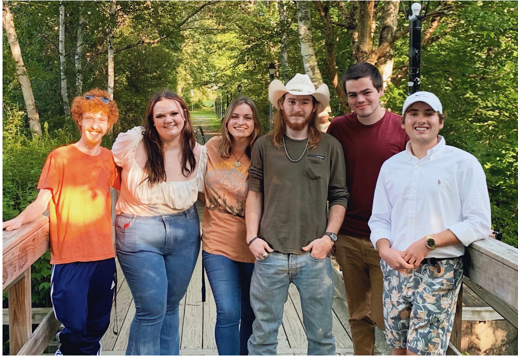
Celebration for the Class of 2020

Oli is full of incredibly brilliant and incredibly kind people. The teachers are some of the smartest and most knowledgeable people I've ever met and every one of them bring all sorts of cool experiences and amazing new things to learn. Oli is also located in a really beautiful area surrounded by forests and mountains, so when you put these two things together, it makes Oli a really nice place to learn and grow.